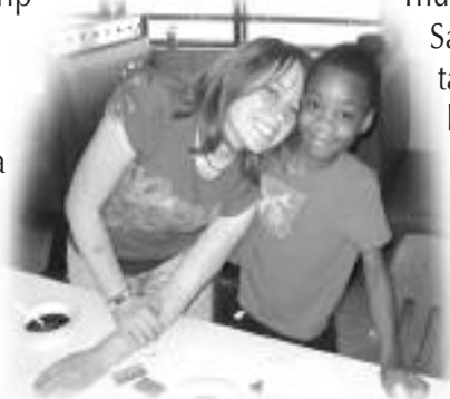
Making friends with the mission team.

The California youth were changed as well. Many expressed interest in coming back to visit, and one even wants to do a summer internship with us.