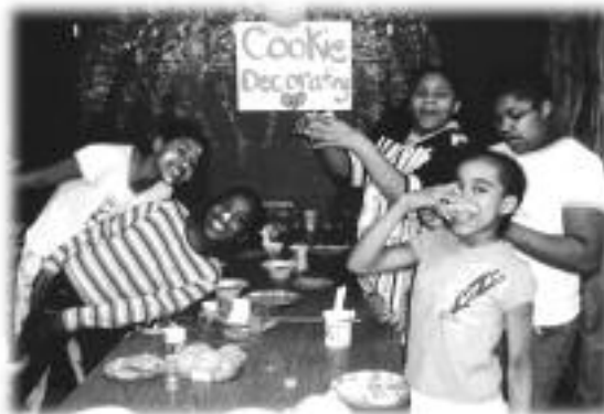
A sweet treat: decorating cookies

The evening started off with a delicious sit-down dinner. Each girl had an assigned seat with a name card telling the biblical meaning of their name. Next, we enjoyed pampering each other with facials, foot massages, pedicures, manicures, and even a hair style. We then had several creative craft projects, jewelry making, and cookie decorating. Do things get any better for us girls? And yet it did.