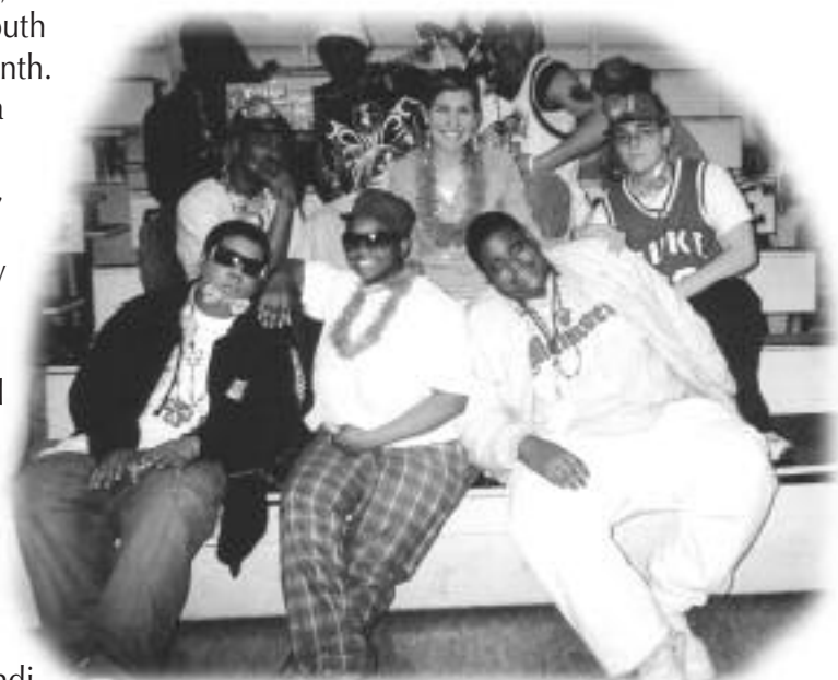
On a mission to make St. Patrick's Day fun!