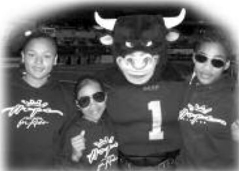
Hope kids with the Omaha Beef mascot.

The Omaha Beef football team promoted the Hope Center for Kids during their season opening game on March 24. Tickets were donated so that Hope kids and staff could attend the game.