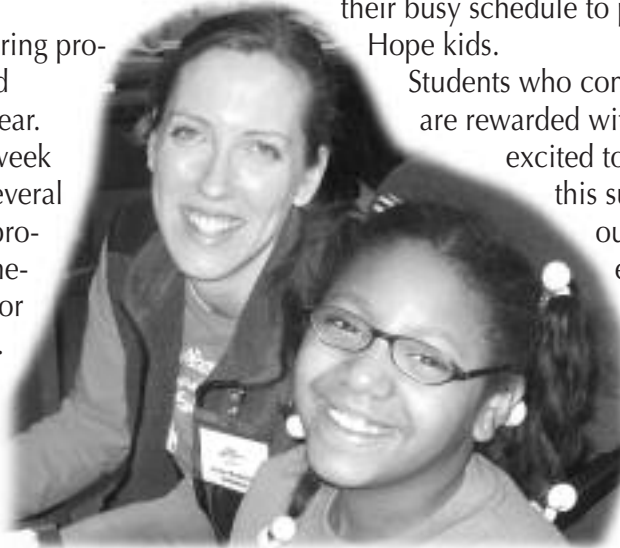
The fun of tutoring at the Hope Center!

Students who complete the tutoring program are rewarded with a special trip. They are excited to find out where we will go this summer. We are so proud of our students. Thanks to the parents for helping their children stay with this commitment. The rewards are greater than any trip they might take. The rewards are strengthened skills and a greater love for learning! Thank you to our wonderful partners for making this available.