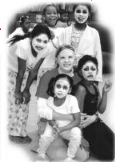
Everyone gets a facial on their "Date with the King."

without - of course - a pajama modeling contest! This was the girls' time to shine, and let their beautiful personalities show. And did they!